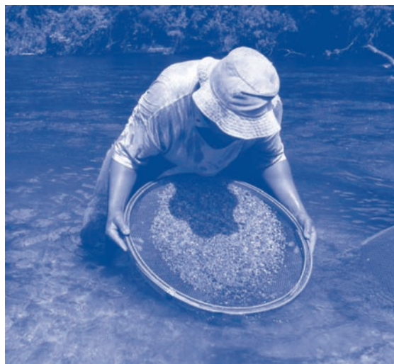
Most Brazilian diamond mining is done by garimpeiros or hand-miners

Ministry of Mines and implemented by the DNPM. Under the Brazilian system, legal export of diamonds with a Kimberley Certificate was tied to possession of a legal mining claim. Most of Brazil's diamonds, however, are produced by garimpeiros working in areas to which they have no legally registered title. In order to cover the export of these paperless stones, Brazilian diamond traders were thus required to fabricate some sort of legitimate looking paper trail.